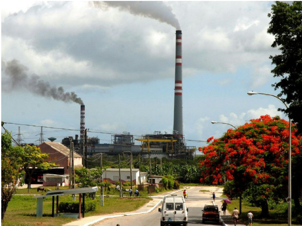
Thermoelectric Power Plant in Nuevitas, Camagüey, Cuba